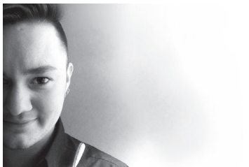
ASSISTANT MUSIC DIRECTOR