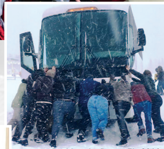
Pushing the Bus to Ely 2016