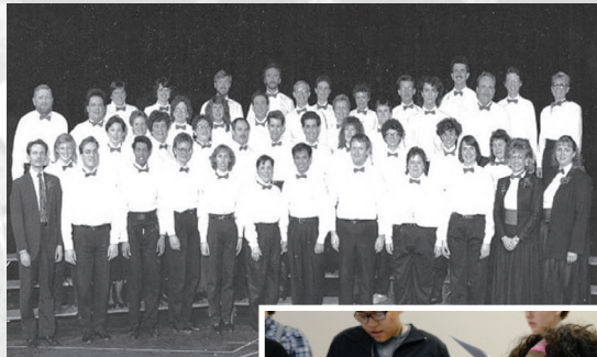
First Concert 1988