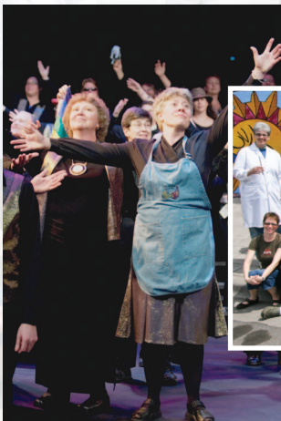
Just for Laughs 2005