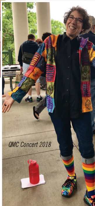
QMC Concert 2018