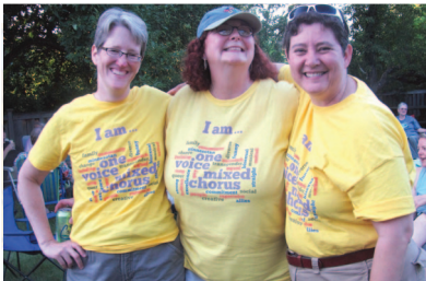
We are One Voice, 2012