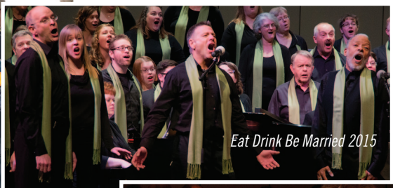
Eat Drink Be Married 2015