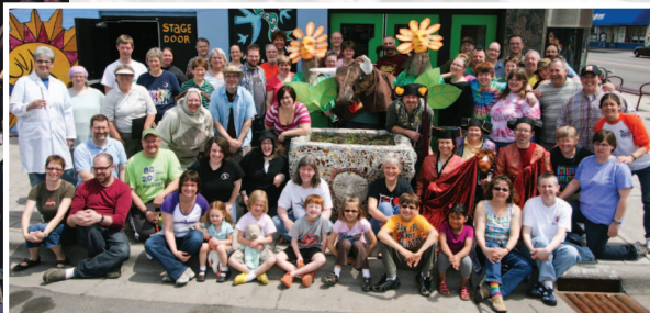
Different is Great 2010