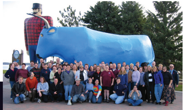
Bemidji Tour 2004