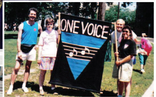
Early Pride Festival, 1990