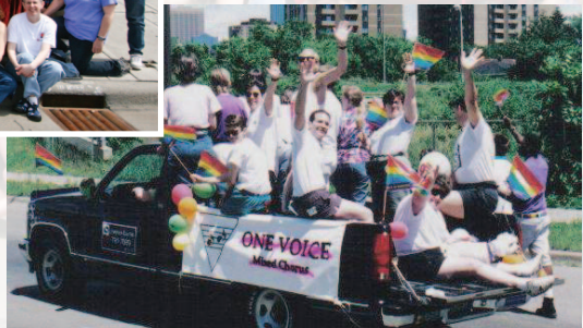
Pride Festival 1993