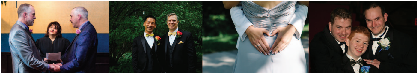
One Voice Weddings 2013