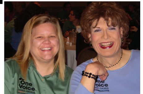
Concerts in St. Cloud 2009