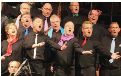
Dublin, Ireland performance 2014

Artistic Director Executive Director Operations Coordinator Office Assistant Accompanist Assistant Director OVation Music Director Accompanist (on leave) Ad Sales Bookkeeper Graphic Design Rehearsal Recordings Rehearsal Accompanists ASL Interpreter Electric Bass Trumpet Percussion Projection Design Video Stage Manager Technical Guru Stage Assistant Concert Attire Diva Braille Programs OVation