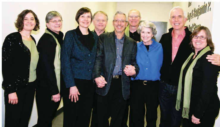
One Voice Founders 2013

The Trans Voices Chorus was formed this past April as a part of One Voice's Transgender Voices Festival. We are delighted that their voices are present today as an important element of our roots and wings!