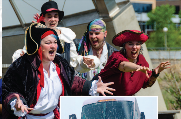
Pirates of Penzance 2017