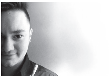
ASSISTANT MUSIC DIRECTOR