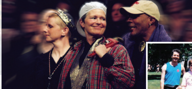
10th Anniversary 1998