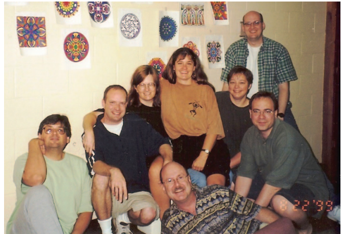
1999 Board Retreat