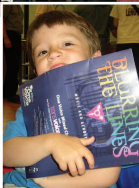
Chorus Kid 2004