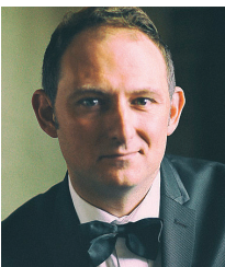
OVATION MUSIC DIRECTOR