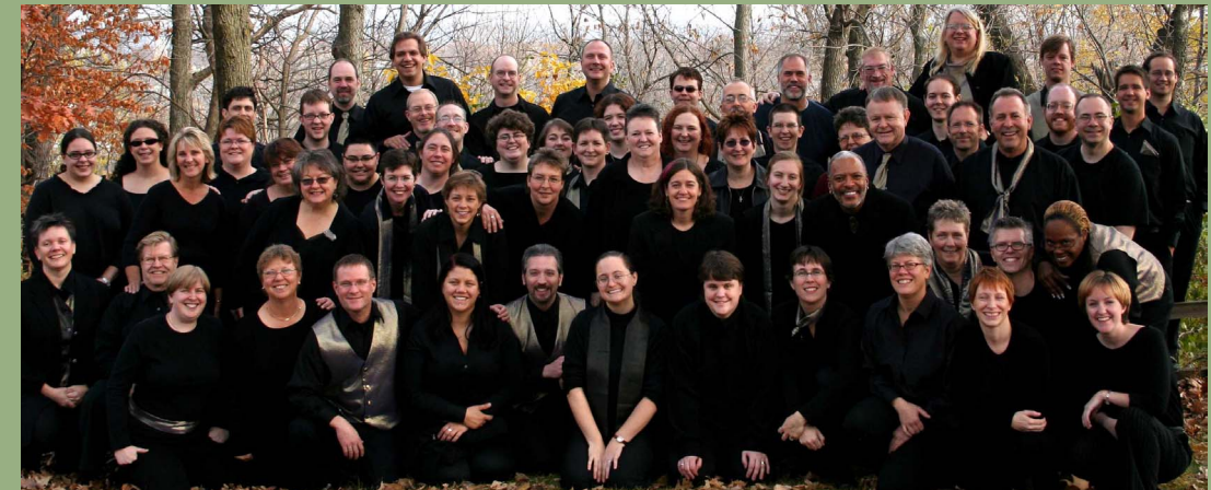
Building community and creating social change by raising our voices in song