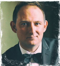
OVATION MUSIC DIRECTOR